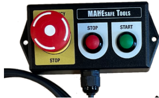
3-Button Control Panel

*All dimensions are for enclosure and do not include dimensions of buttons, plugs, and cable glands.