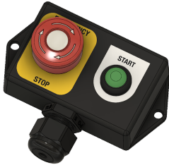
Control Panel (Industrial)

3.0" x 2.0" x 0.9" in. (76.20 mm x 50.80 mm x 22.86 mm)